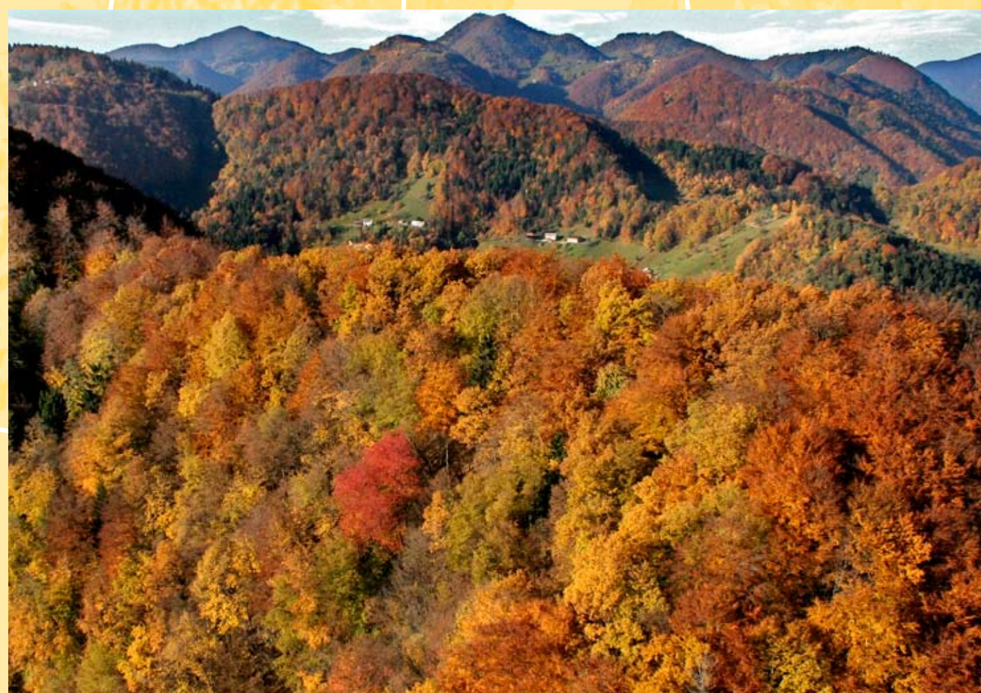
A deciduous forest in Slovenia

Dynamic gene conservation emphasizes maintenance of evolutionary processes within tree populations to safeguard their potential for continuous adaptation. In the face of climate change, this is crucial for the long-term sustainability of forests and forestry in Europe.